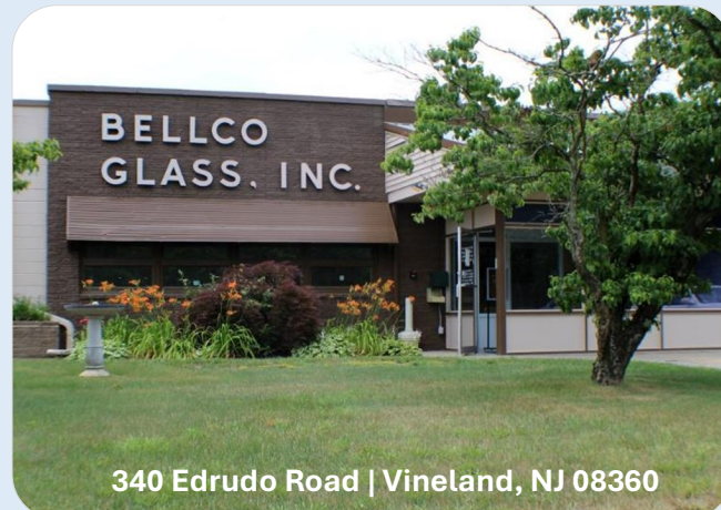
340 Edrudo Road | Vineland, NJ 08360